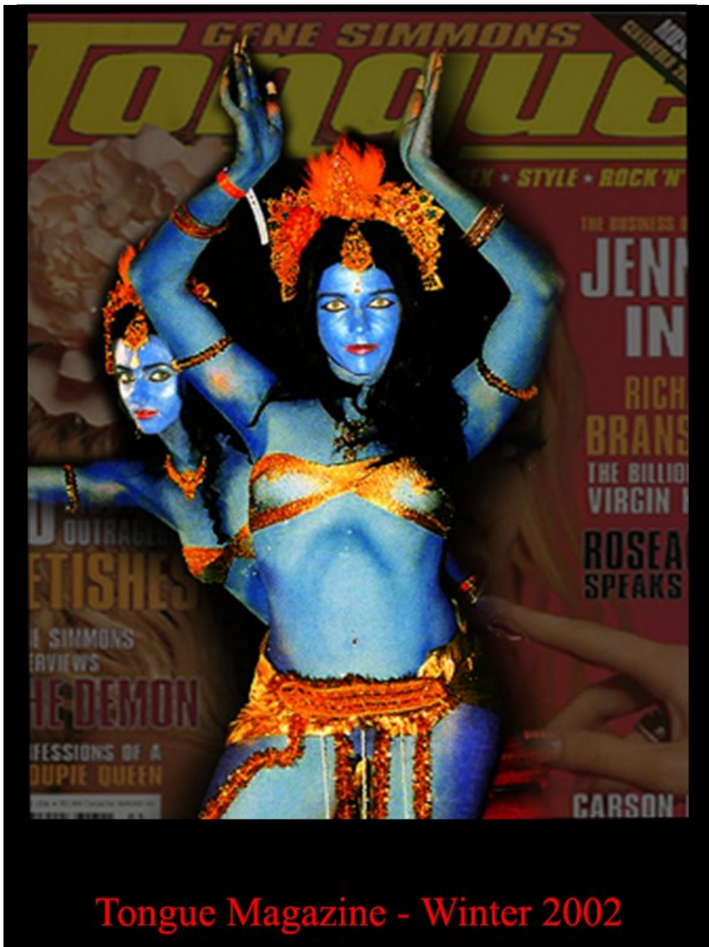
Tongue Magazine - Winter 2002