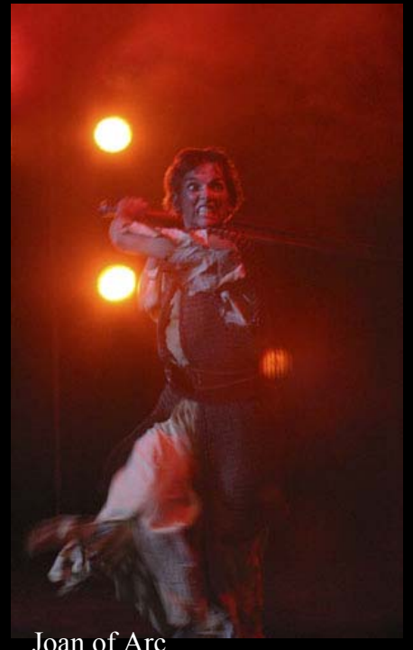
Joan of Arc